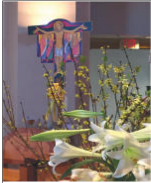
Prayers for Healing

The St. Vincent de Paul Society has greeting cards available. These cards are sent by the Society to a person you designate. You can have the cards sent to let them know that you have made a contribution to the local Society either in memory of their deceased loved one, as a tribute in their honor or for healing prayers prayed by members of the Society. Directions for each type of card request are on the request form, found on the bulletin board (to the right as you enter church) in the narthex. Please take a form, fill it out, and return it in the envelopes provided either in the Sunday collection or the mail.