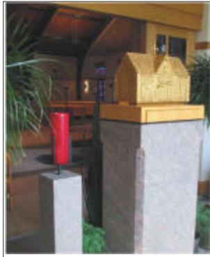
In Loving Memory